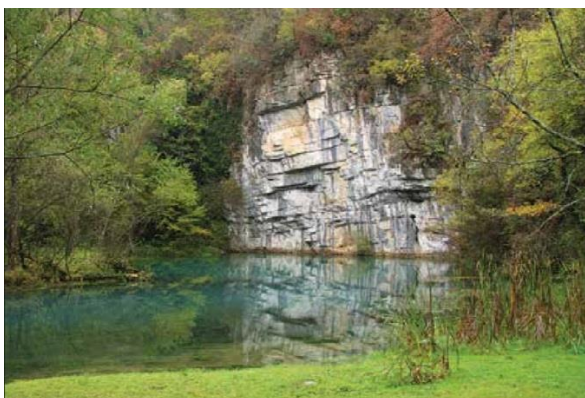
Plut D. et al., 2014. Regionalni viri Slovenije: Vodni viri Bele krajine (Water resources of Bela krajina), 15.